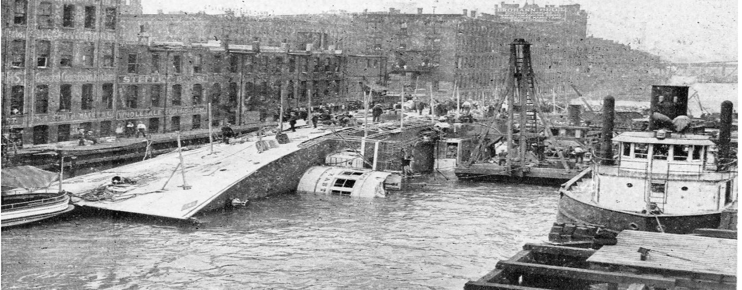
Raising the Eastland